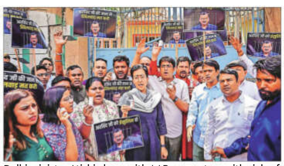
Delhi minister Atishi along with AAP supporters with vials of 'insulin' during a rally outside the Tihar jail on Sunday